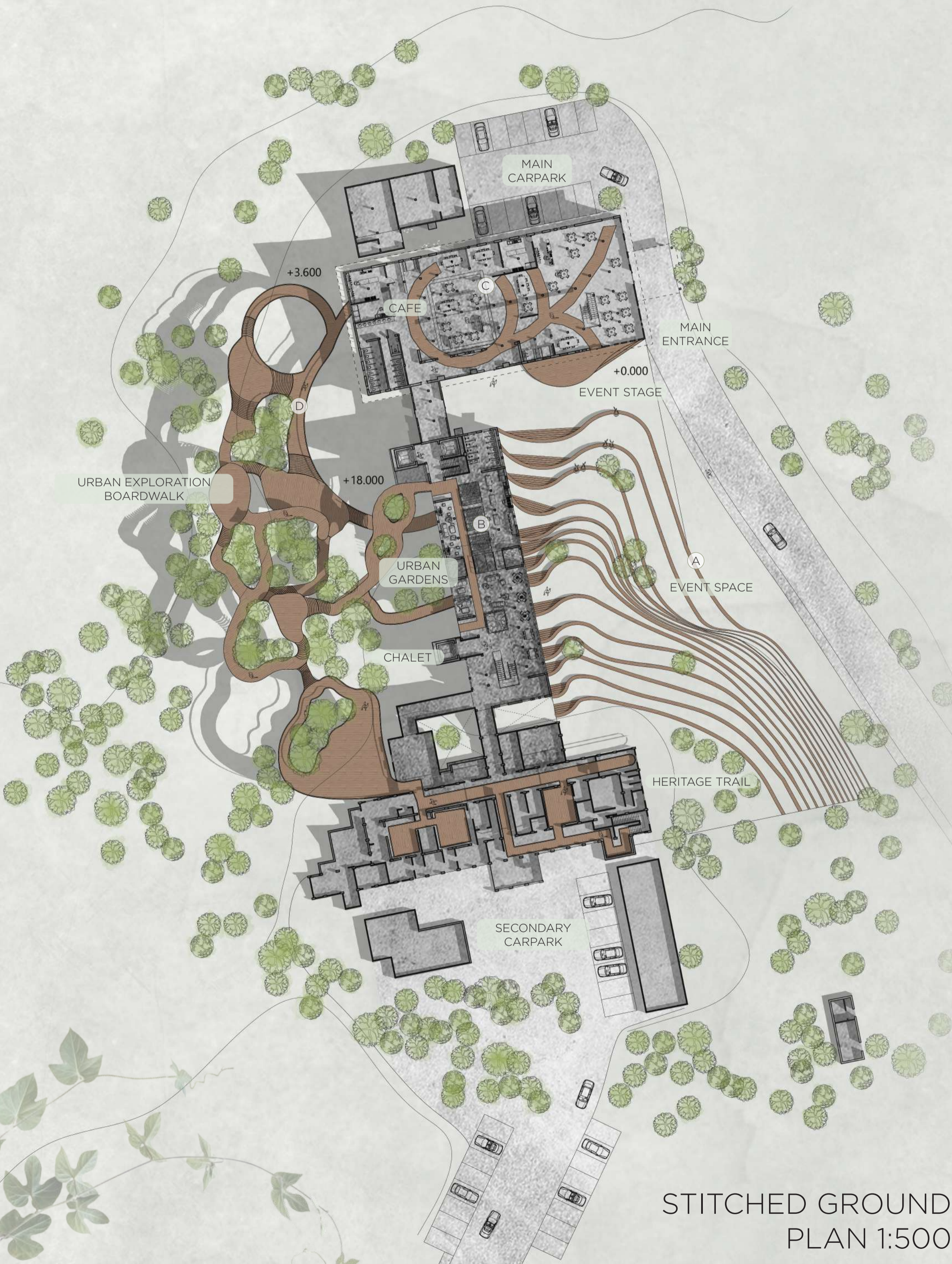
STITCHED GROUND PLAN 1:500

THE 3 EXISTING BLOCKS WOULD BE REFURBISHED AND/OR PRESERVED TO CREATE A GRADATION OF CONSERVATION THAT PROMOTES THIS NEW LIFESTYLE, WHILE SHARING THE STORY OF OLD CHANGI HOSPITAL.