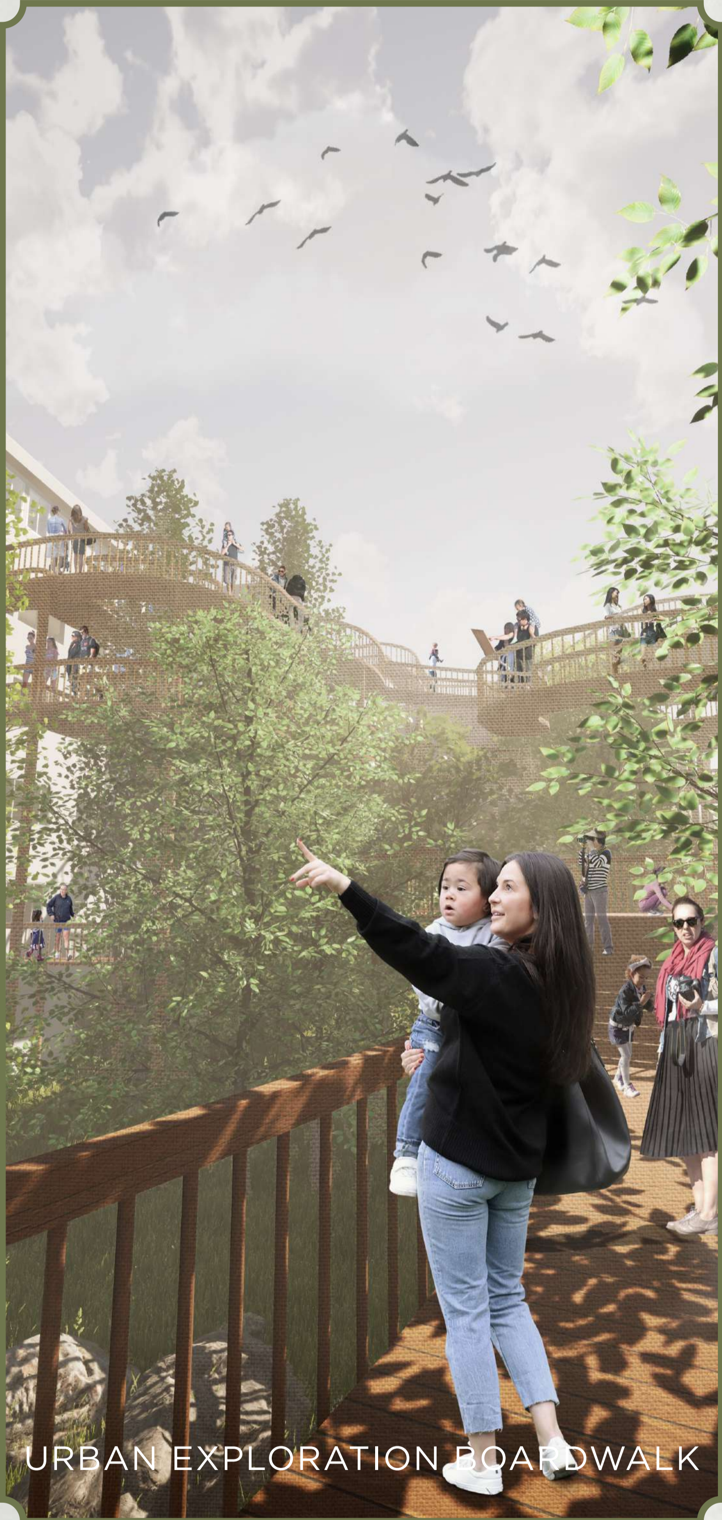
URBAN EXPLORATION BOARDWALK

SITTING AT THE MAIN ENTRANCE, THE CAFÉ IS THE PUBLIC'S FIRST ENCOUNTER OF THE REFURBISHED CHANGI HOSPITAL BUILDING, AND THEREFORE SETS THE TONE OF THE ENTIRE FACILITY. ATRIUMS ARE PUNCTURED THROUGH THE FLOORPLATES, SO AS TO OPEN EACH FLOOR TO THE INDOORS GARDEN FEATURING THE BOARDWALK THAT SPIRALS UP AND AROUND THE ATRIUM. THIS IN HOPES OF EXPRESSING THE FANTASTICAL BEAUTY OF NATURE AND HEALING, AMIDST THE PARTIALLY PRESERVED RUINS OF THE PREVIOUS BUILDING.