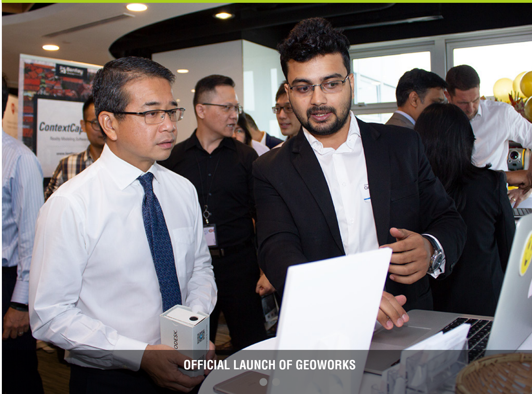
OFFICIAL LAUNCH OF GEOWORKS