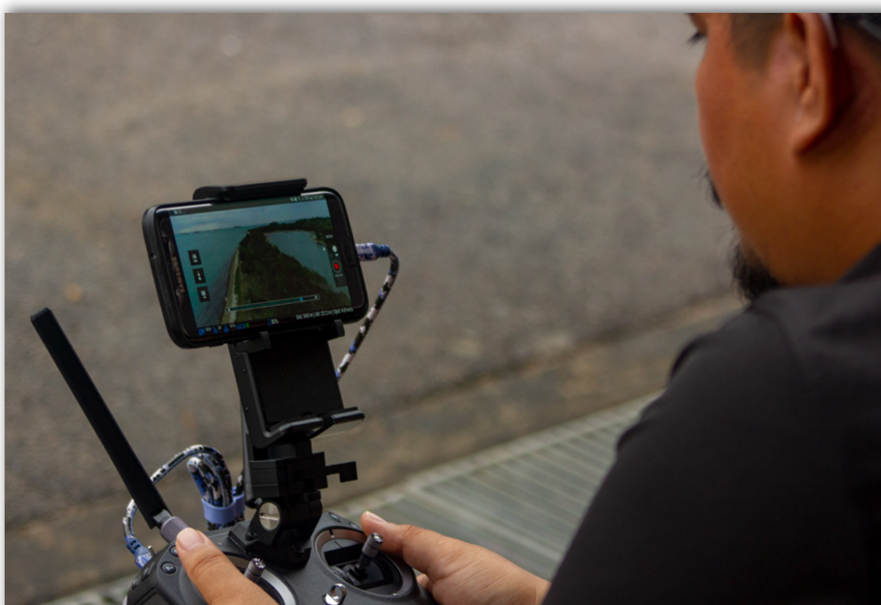
► Monitoring offshore islands with drone imagery

In addition to the mobile apps, SLA's Land Management team had also kickstarted the remote monitoring of utilities at State properties, supported by the use of drone imagery with machine learning technologies. In the pipeline are plans to implement the use of fully automated drones for the inspection of offshore islands, reducing the time required for physical commute to the various islands.