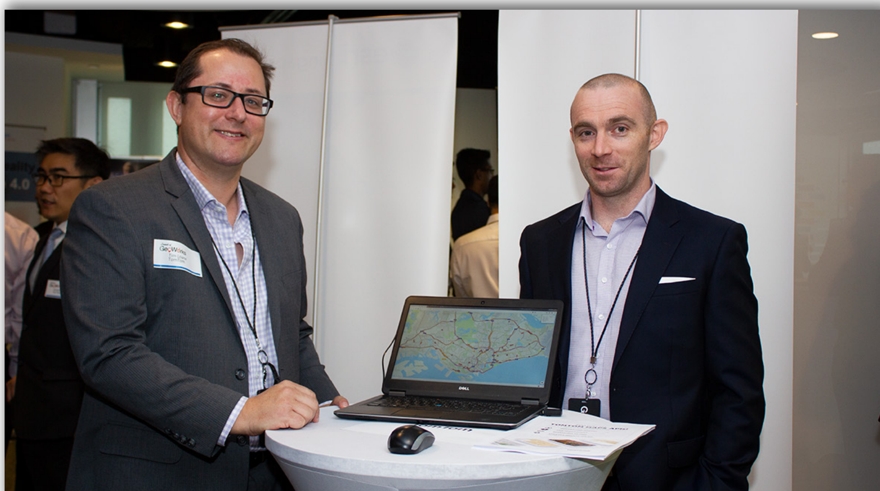
► One of the many GeoTechs present at the launch of GeoWorks to showcase their products and capabilities