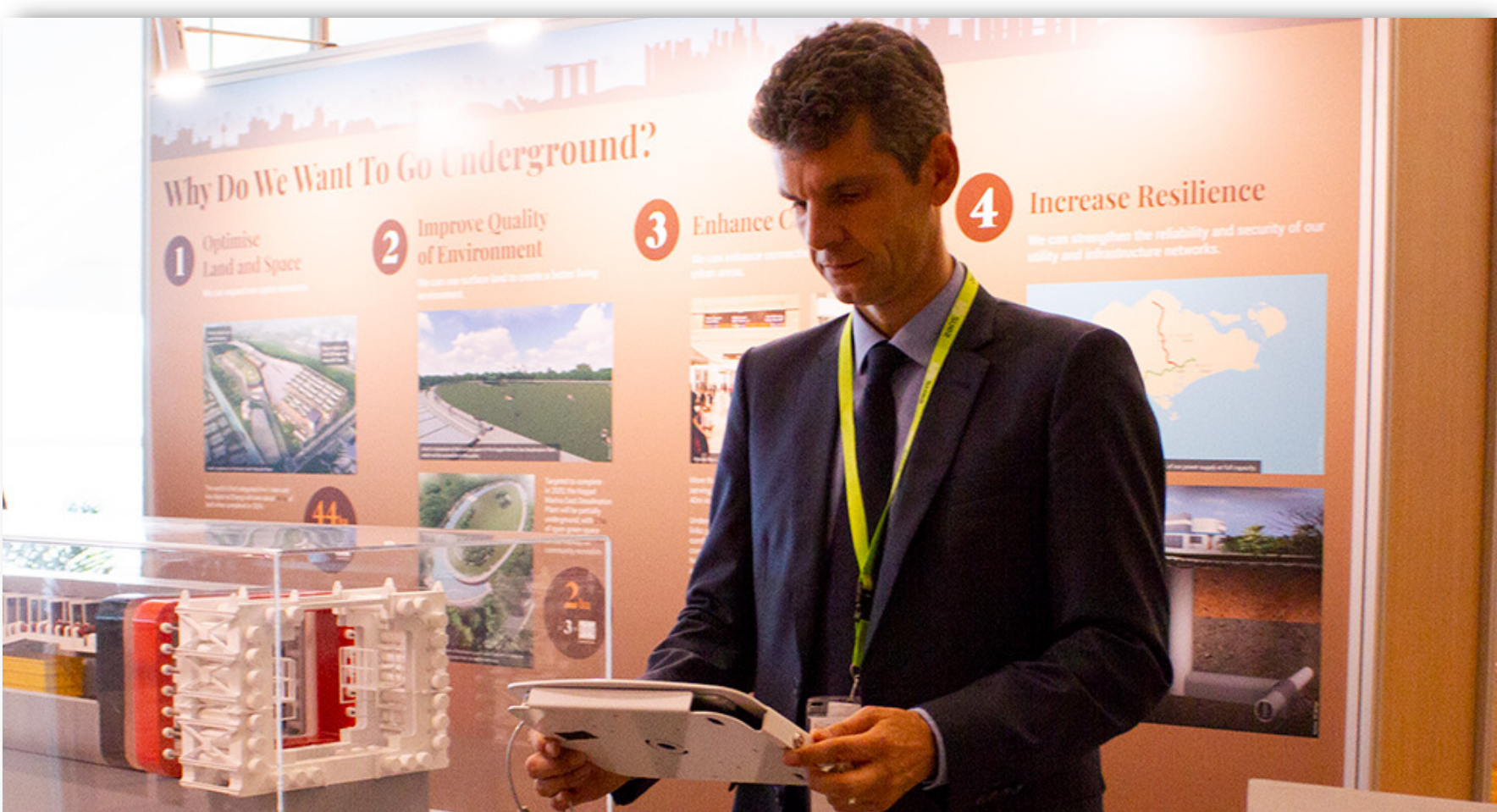
► A visitor testing out the prototype of “Digital Underground”, an initiative programme which aims to establish a roadmap, best practices and technologies for mapping underground utility networks

The exhibition also displayed the capabilities of the Singapore Advanced Map (SAM), an integrated 2D/3D map system developed in-house by the Land Survey Division which provides comprehensive access to 3D information in supporting SLA’s role of land administration and land management. By combining 2D and 3D visualization, SAM showcases an integrated environment both above ground and underground, supporting different levels of details seamlessly and empowering decision-makers from various departments with enhanced spatial analytics capabilities that allows them to derive actionable insights from the dataset.