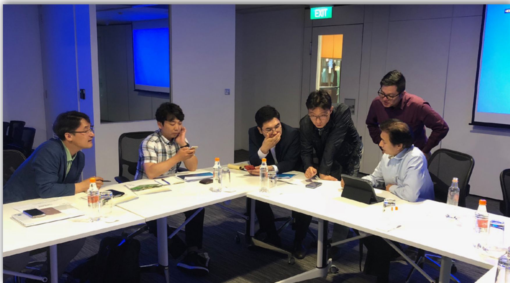
► Delegates from Korea Land and Housing Corporation & LG CNS understanding more about the role OneMap played in Virtual Singapore while also sharing their development of Sejong Smart City in Korea with SLA

The study visit was followed by a visit from a group of Municipal Commissioners from Andhra Pradesh on 11 June 2018, hosted by ACE (Land Ops), during which the delegates posed many questions to us during the Q&A session and shared the challenges they faced back in India.