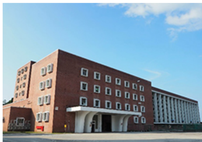
Pasir Panjang Power Station A - 29 July 2017

"Discovering Singapore's Best Kept Secrets" kicked off on Saturday, 29 July 2017 with a visit to Singapore's second power station after St James Power Station - Pasir Panjang Power Station A (PPPS) with more than 30 participants. Follow #SLaSecretSpaces on Facebook and Instagram for more information on the visits.