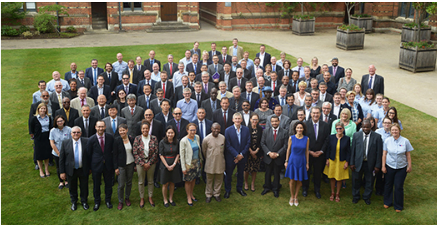
Invited delegates and speakers at the Cambridge Conference 2017