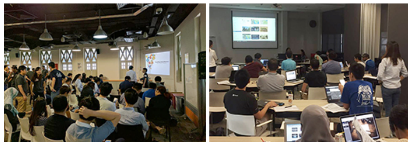
Participating teams at the OneMap IdeaWorks! workshops