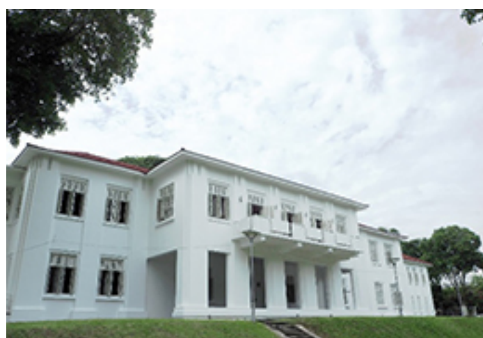
Former Kinloss House at 3 Lady Hill Road - 12 August 2017