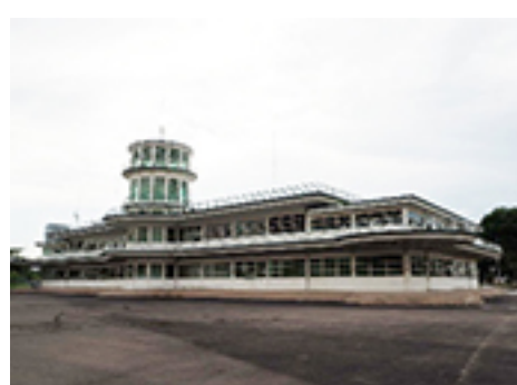
Old Kallang Airport - 26 August 2017