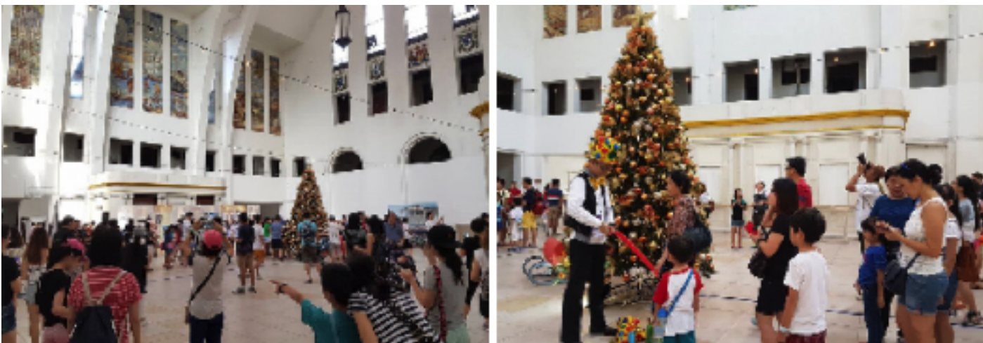
Christmas tree and balloon sculptor in the main hall

The final TPRS Open House – themed Celebrate Christmas at TRPS was a festive occasion where 36,819 visitors enjoyed jazz performances held under the stars along the rail platform. It is now closed for construction of the Circle Line Cantonment MRT station