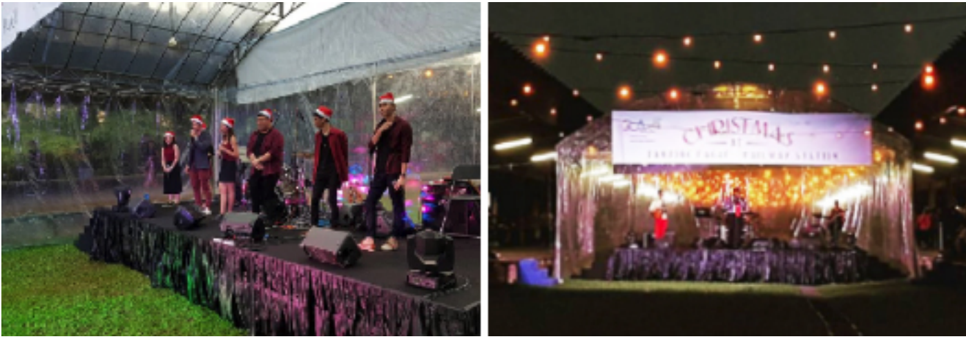
Live performances included an a capella performance by NUS Resonance