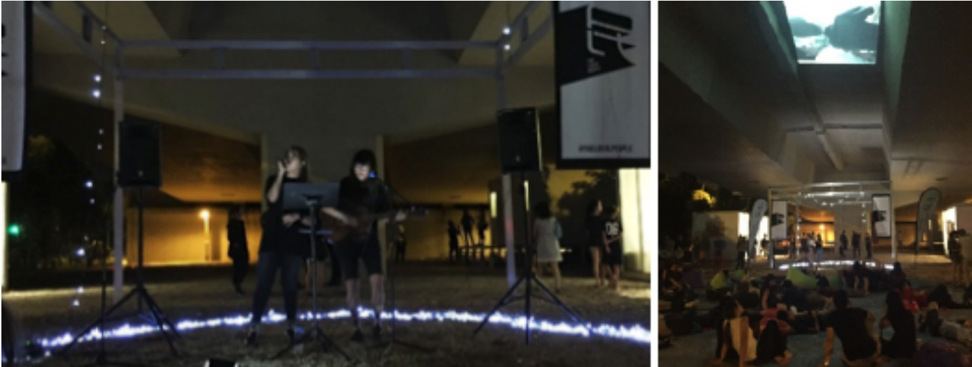
Visitors lounging on the inflatable beds and enjoying the live performances and movie screening