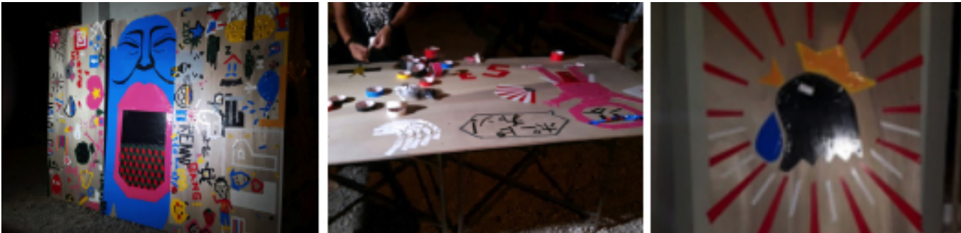
Duct Tape Public Art