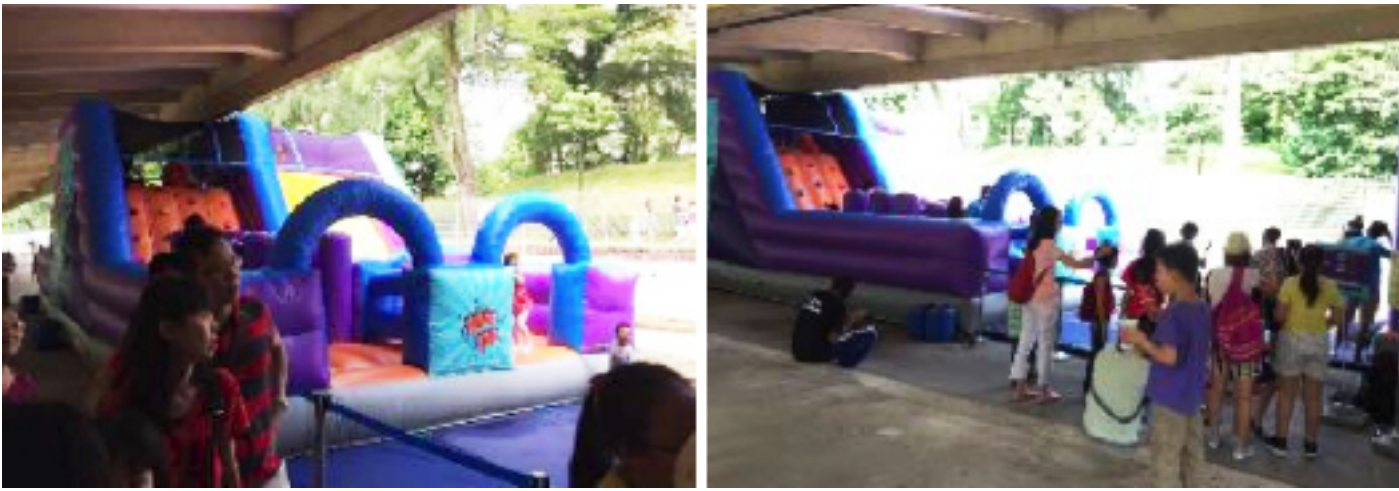
Bouncy castle for children