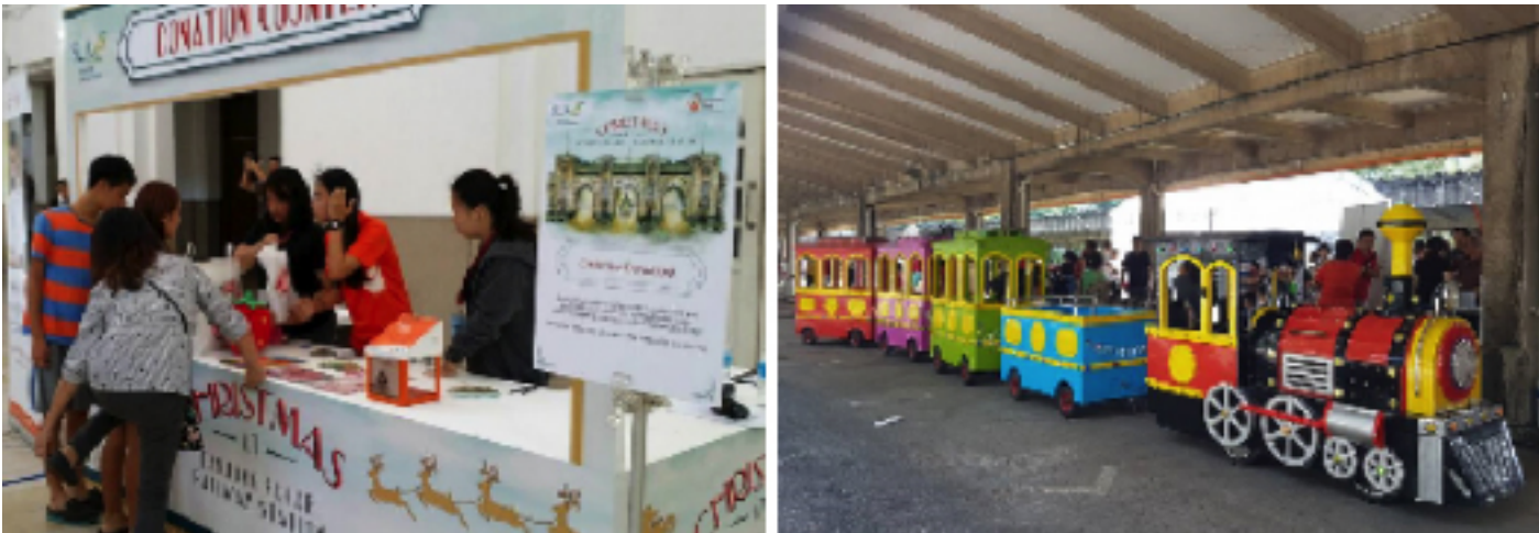
CSR efforts include collection of toys and books and proceeds from Choo Choo Train rides go to the Community Chest