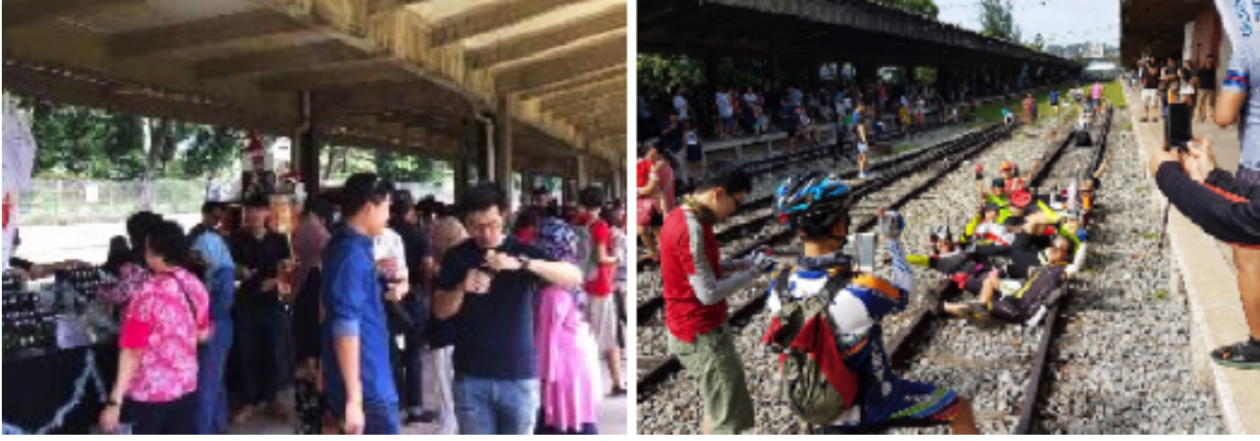
Christmas market and photo-taking enthusiasts along the rail platform