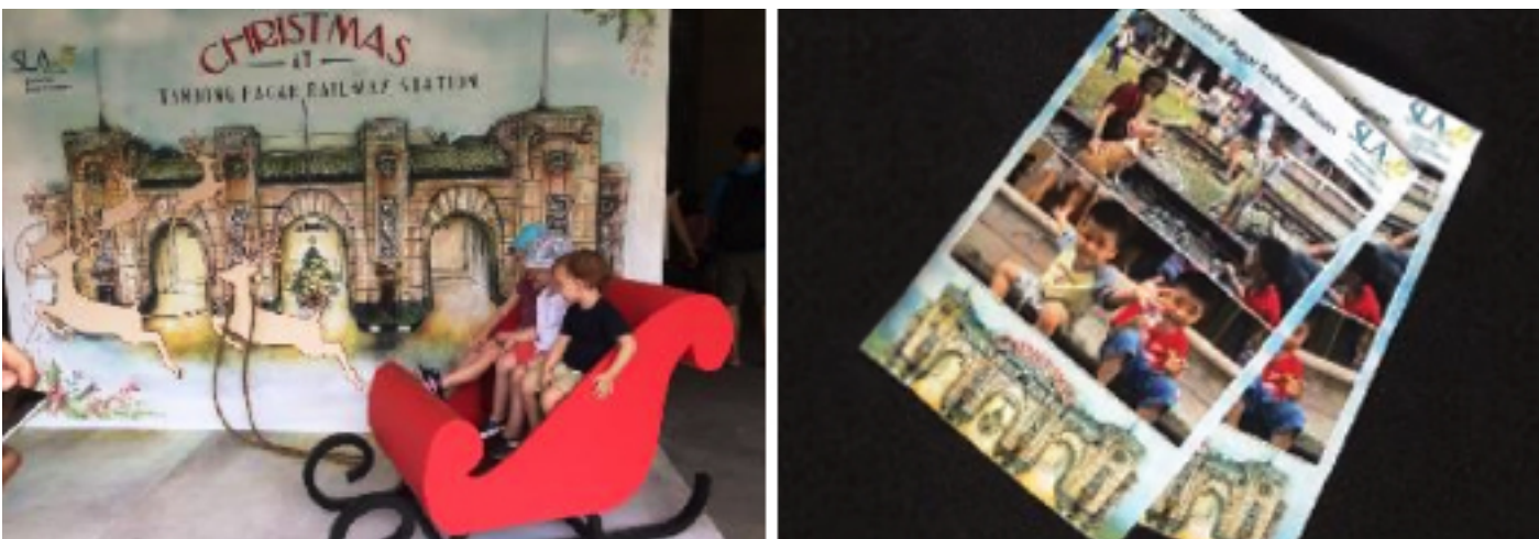
Christmas photo booth and free photo printouts