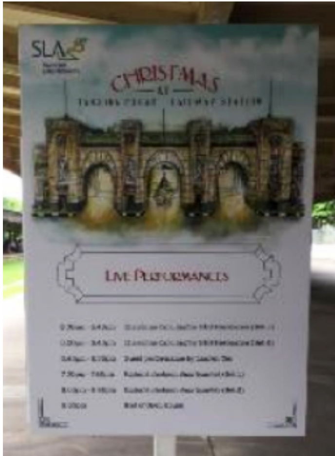
Live performances included an a capella performance by NUS Resonance

The final TPRS Open House – themed Celebrate Christmas at TRPS was a festive occasion where 36,819 visitors enjoyed jazz performances held under the stars along the rail platform. It is now closed for construction of the Circle Line Cantonment MRT station