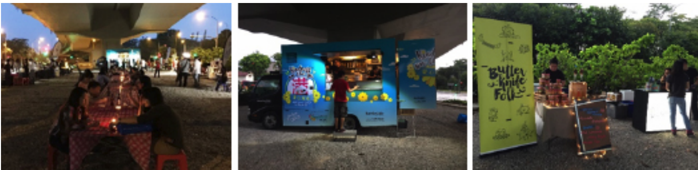
Art Market with an array of locally produced arts, crafts, delectables and food from Kerbside Gourmet

SLA collaborated with The Local People to organise the first-ever night Art Market on the State land under West Coast Viaduct on 21 January 2017. Visitors contributed to the duct tape public art installations and were entertained with live performances by local musicians and the screening of short films from the Singapore Heritage Short Film Competition.