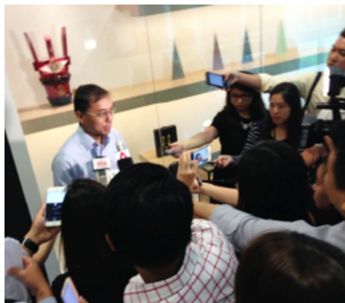
SLA CE's interview with media

SLA and LTA announced the acquisition of Raffles Country Club (RCC) for the KL-Singapore High Speed Rail (HSR), Cross Island MRT Line's (CRL) Western Depot and other transport related needs on 4 January 2017.