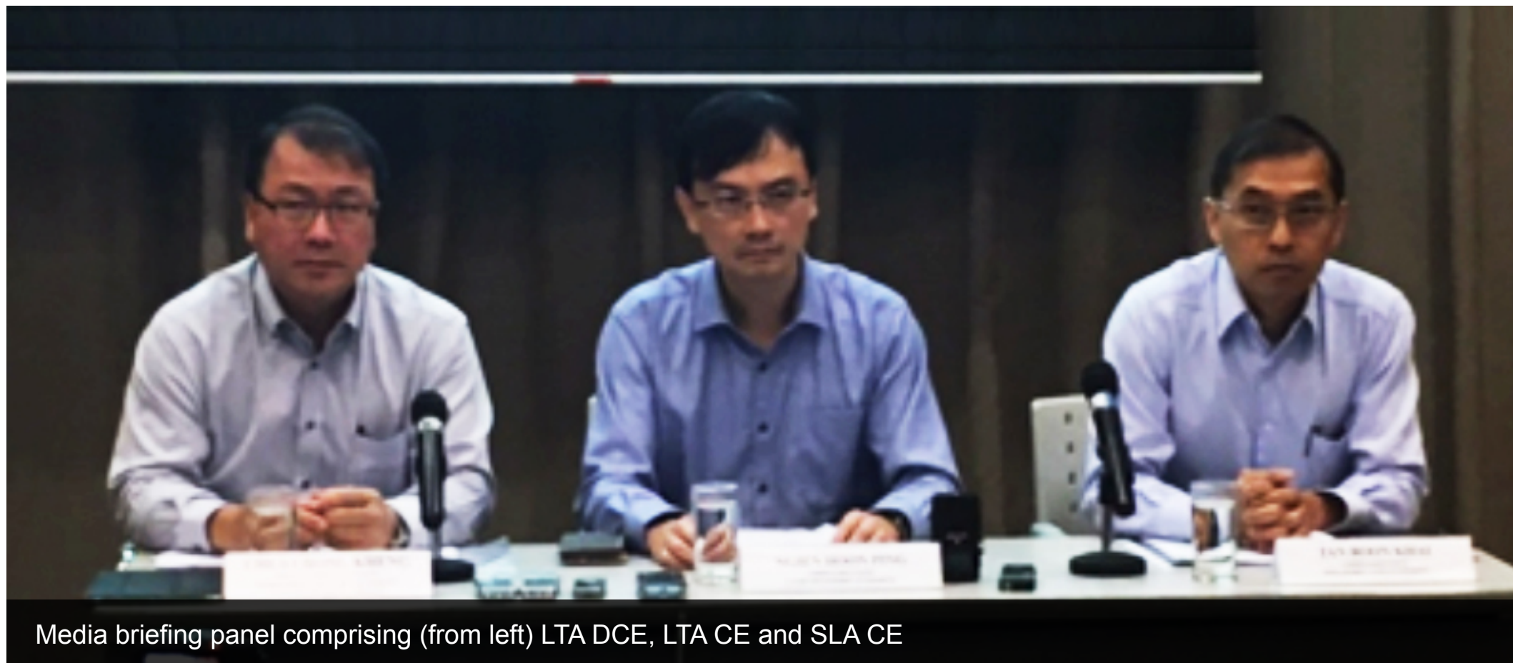
Media briefing panel comprising (from left) LTA DCE, LTA CE and SLA CE