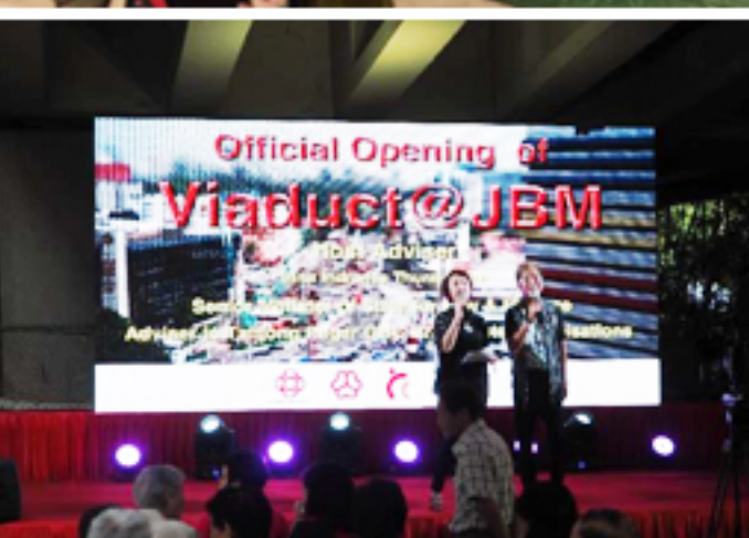
Viaduct@JBM was launched with a carnival and getai show for 300 Tiong Bahru residents