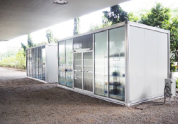
The vegetables were grown in see-through modular structures

How do you farm under an expressway with no direct sunlight? Are the vegetables safe for consumption with the pollution coming from the traffic surrounding the farm?