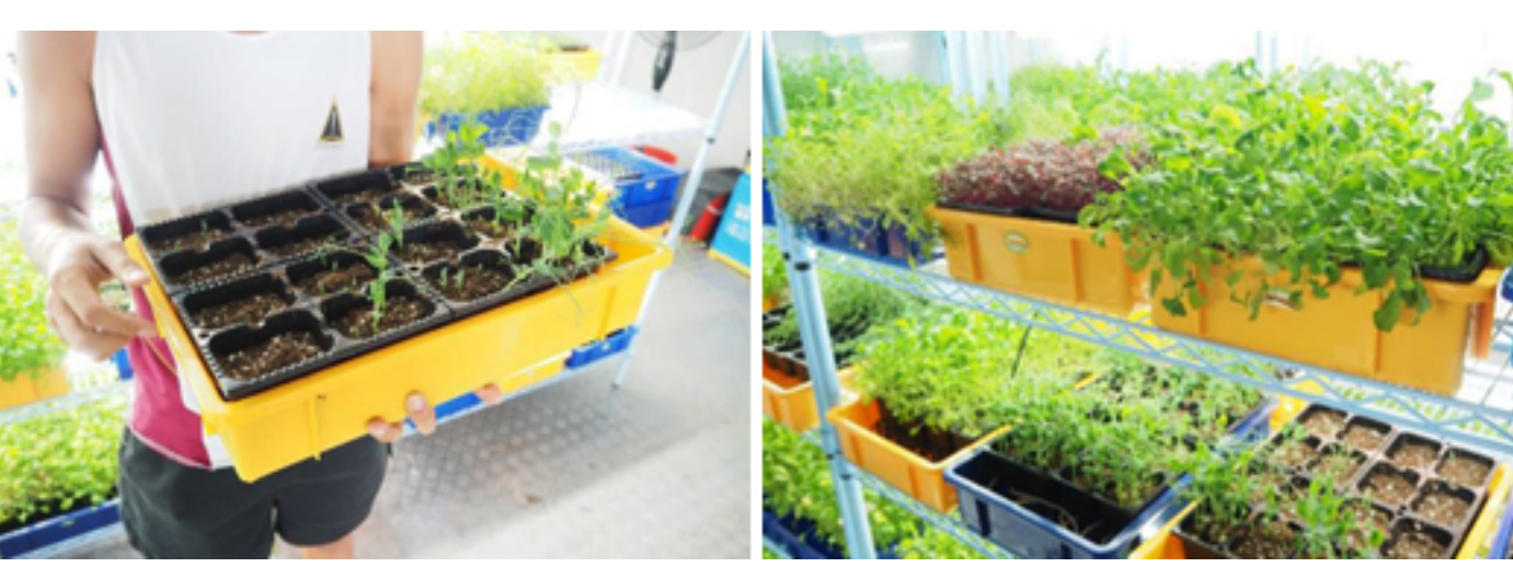
Vegetables were grown in trays and placed on vertical racks to maximise space

The vegetables under West Coast Viaduct are grown in a controlled environment. The modular structures provided by SLA were transformed into greenhouses retrofitted with air-conditioning kept at a constant 22 degrees. An additional fan helps improve air circulation in the structure. "The vegetables can grow faster and better this way" explained Darren as he enthusiastically shared his wealth of knowledge in urban farming. The setup at his farm also uses affordable everydaymaterials; the vegetables were grown in trays placed on simple four-level racks to maximize space. Florescent lights installed on the racks provided lighting for the plants. "We don't have to worry about pest or contaminants as it is a controlled and very clean environment" explained Darren as he brought us on a tour of the farm. Currently, the farm is able to produce mushrooms and a variety of micro-greens vegetables which are supplied to restaurants. Darren has plans in the future for the produce from urban farms such as this to be made available to households.