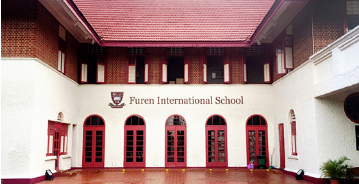
Visit to Old Admiralty House on 16 September 2017. Current tenant, Furen International School kindly supported the visit.