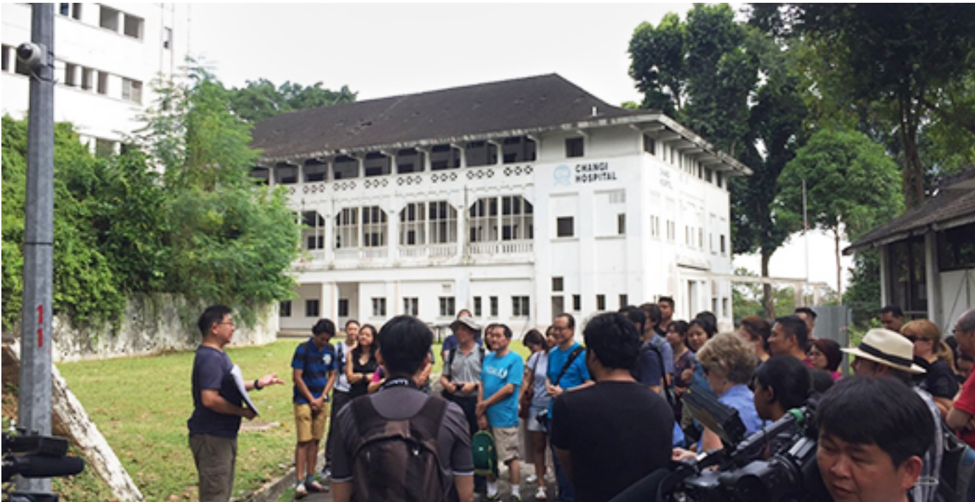
Visit to Old Changi Hospital on 9 September 2017

Follow #SlaSecretSpaces on Facebook and Instagram to learn more about the programme.