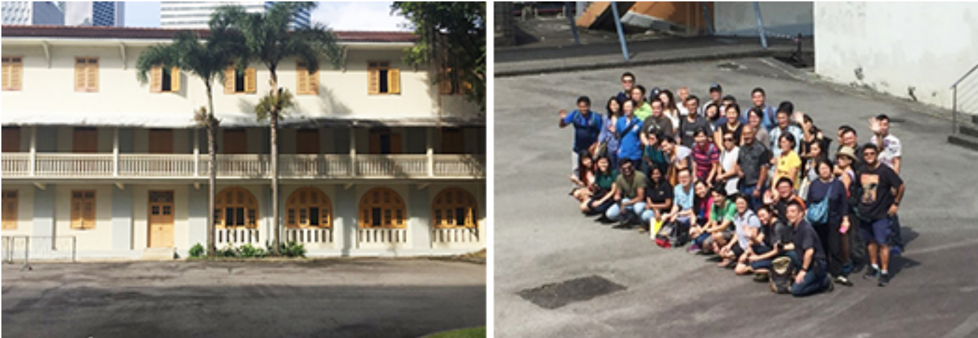
Visit to the Former Beach Road Police Station on 7 October 2017