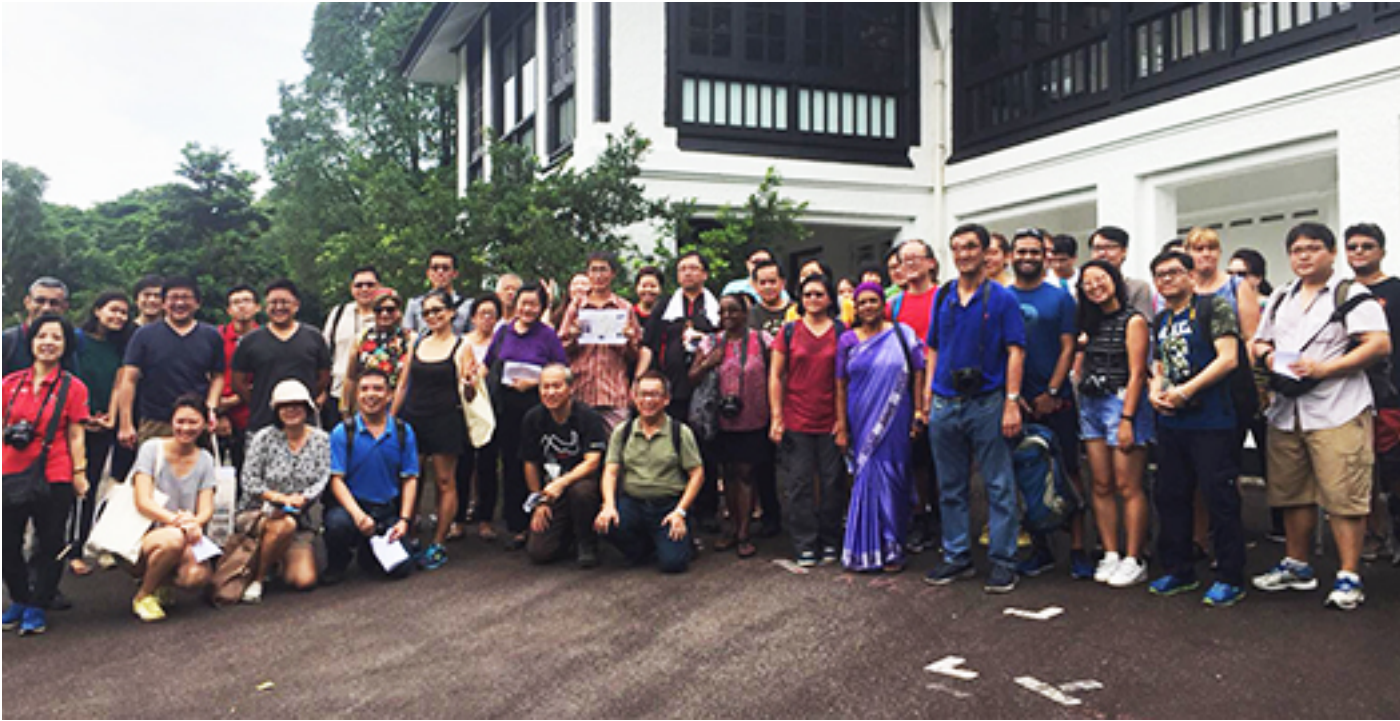
Visit to Adam Park Estate on 4 November 2017